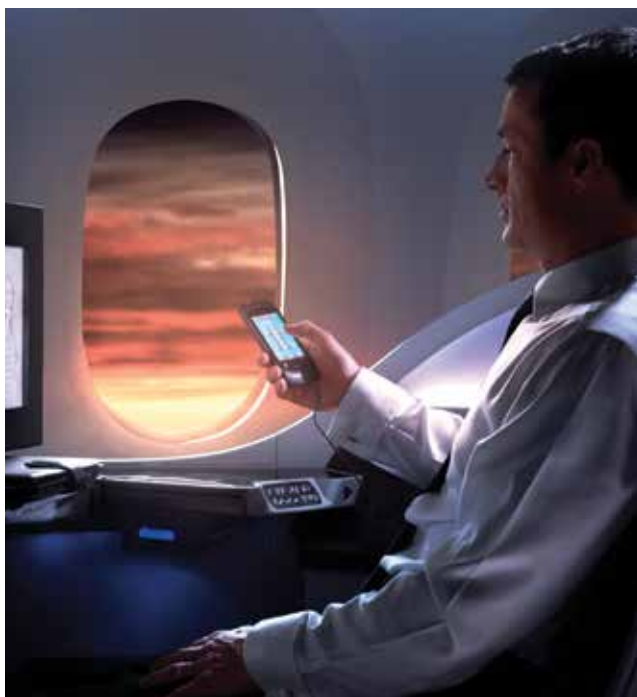
More than 90% of passengers want quality WiFi available for their entire airline journey

Nearly three out of every four passengers would switch airlines if another carrier offered faster and more reliable WiFi. Additionally, the survey said, passenger annoyance was growing. In the last 12 months, 22% of passengers said their inflight WiFi was extremely reliable, compared with an approval rating of 27% in 2014.