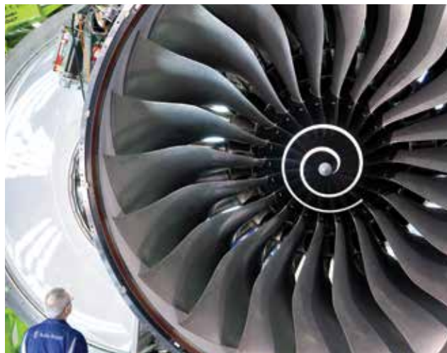
Rolls-Royce aircraft engines earned 51% of total revenue from aftermarket contracts in 2014

Privately, airlines are increasingly uneasy about the power wielded by equipment suppliers, who are controlling a market formerly serviced –largely – by third party MRO companies. Some carriers have said equipment suppliers of are withholding crucial information on products, such as manuals and technical drawings, to ensure that only they or their partners can provide spare parts or carry out high-quality maintenance.