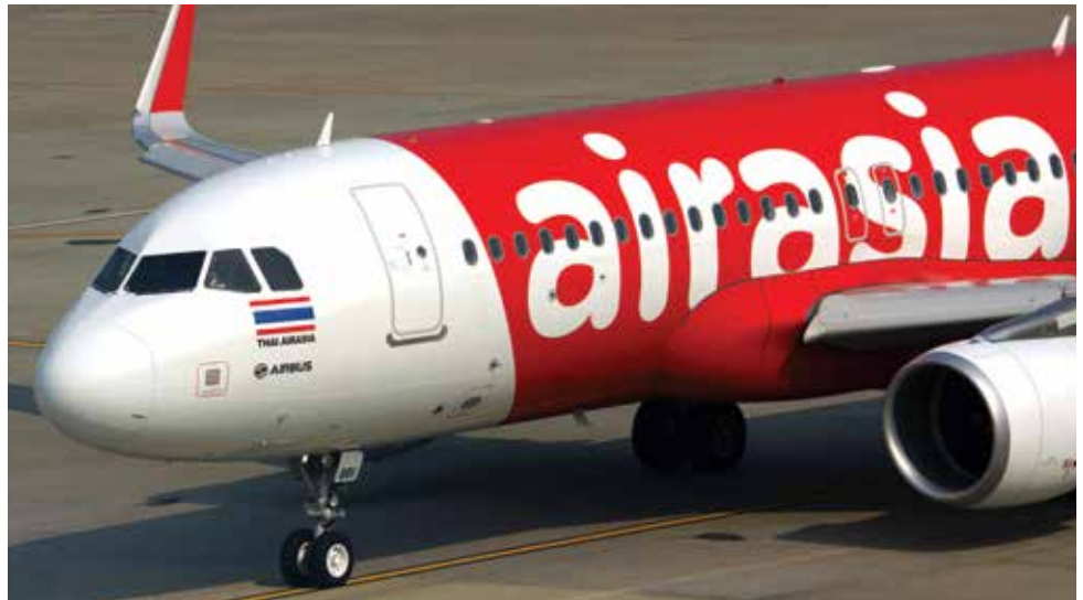
The Bangkok-based LCC plans to have a fleet of 51 A320s by year end

avid supporter of English soccer, but when he paid $55 million for Leicester City in 2010 it was a second tier team. After the team's promotion to the Premier League in 2014 he said he would spend $240 million to break into the top five clubs within three years. He beat his own deadline