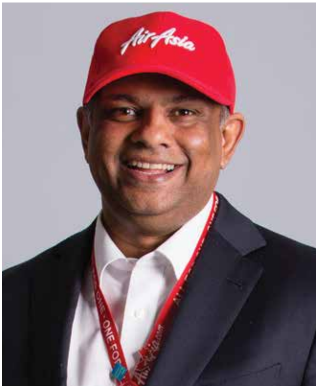
AirAsia Group retains 45% of Bangkok budget carrier, Thai AirAsia

It flies six A330s to more than 20 regional and 29 international destinations from Bangkok's Don Mueang International airport. In June, it launched flights to Muscat in Oman. In 2015, 85,000 tourists visited Thailand from Oman, according to figures from the Tourism Authority of Thailand. The numbers are projected to rise above 10% to 100,000 in 2017. Also in June, AAX started direct flights to the Iran's capital, Tehran. ■